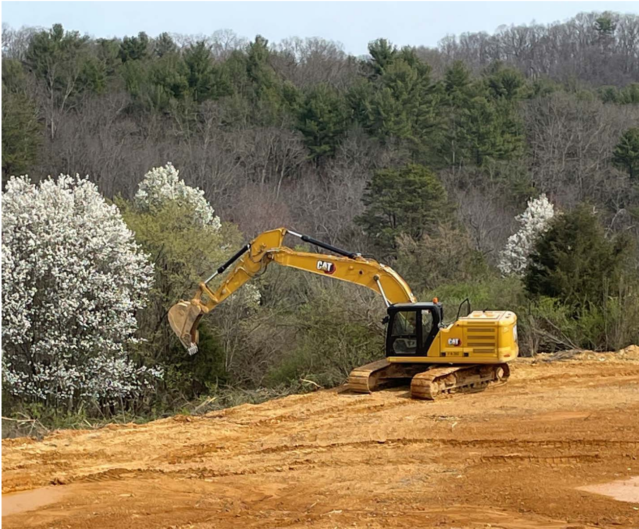
Figure 1. Removal of Vegetation from Landfill Side Slopes

month of March the City was able to clear slopes to begin the process of placing additional intermediate cover. A photo of City staff clearing vegetation from the slopes of the SWP #498 Landfill is shown in Figure 1. During the month of April the City will perform a soil thickness verification investigation to determine if any areas of the landfill need additional soil cover.