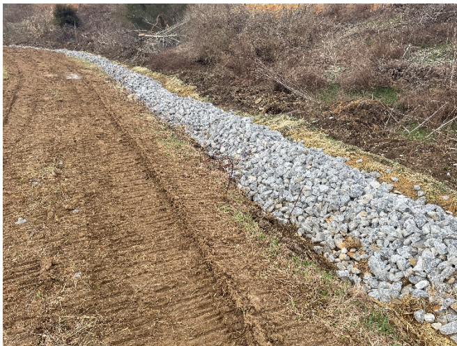
Stormwater diversion channel and trench berm with sediment removed, erosion control matting in place, and aggregate placed.