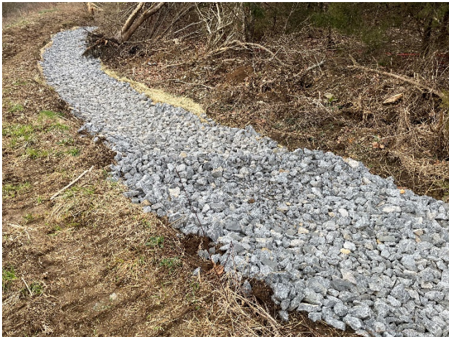
Stormwater diversion channel and trench berm with sediment removed, erosion control matting in place, and aggregate placed & spread.