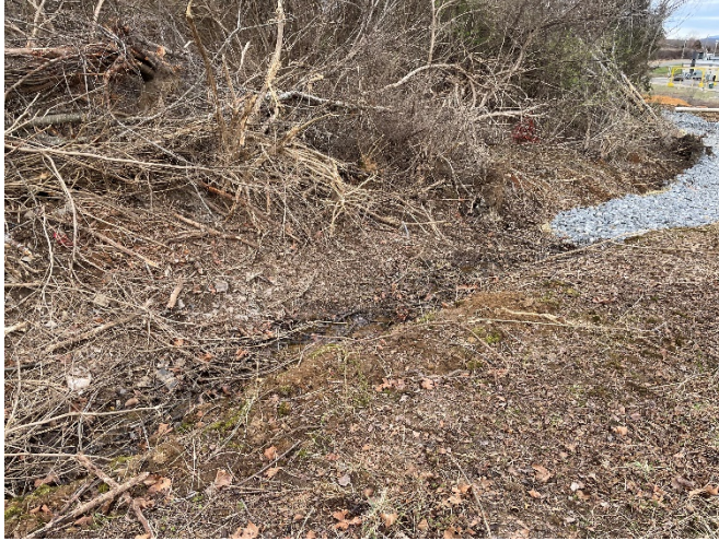
Stormwater diversion channel and trench berm prior to clean-out and stabilization.