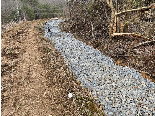
Stormwater diversion channel and trench berm with sediment removed, erosion control matting in place, and aggregate placed & spread.