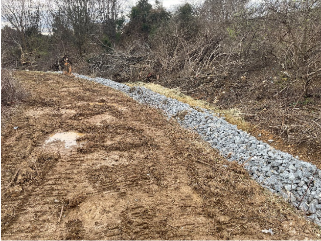
Stormwater diversion channel and trench berm with sediment removed, erosion control matting in place, and aggregate placed.