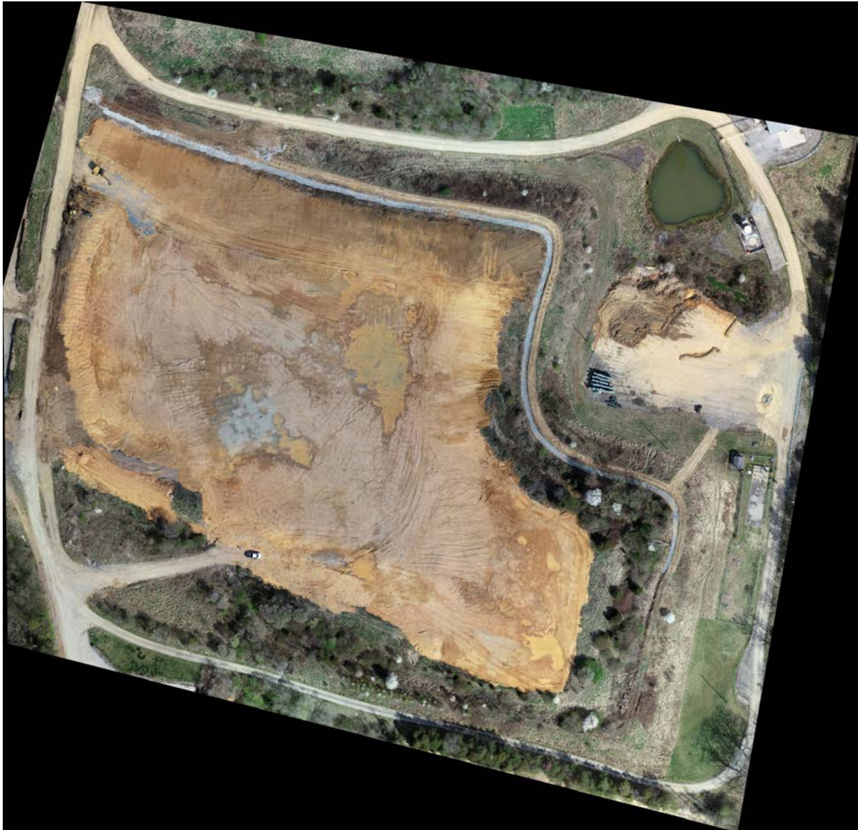
Figure 2. Aerial Photo of the SWP #498 Landfill

On March 10, 2023 SCS and the City received VDEQ's comments on the proposed permit modification. SCS is preparing revisions and a response to VDEQ's comments. On March 24, 2023 SCS discussed the comments with VDEQ and received additional clarifications via a conference call.