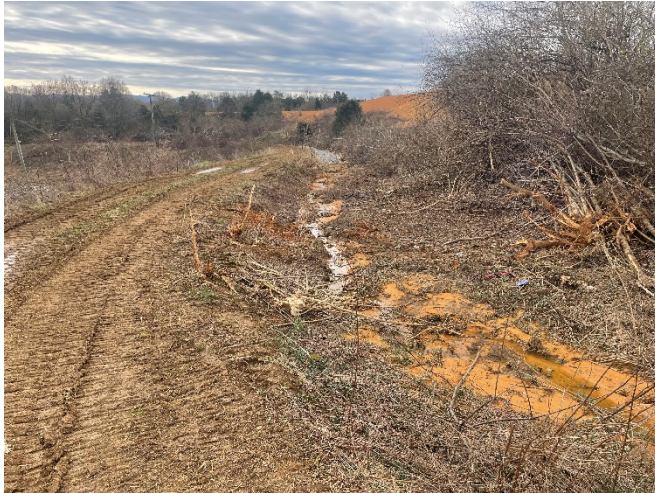
Stormwater diversion channel and trench berm prior to clean-out and stabilization.